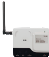
RTR-500NW/AW Base Unit ( required )